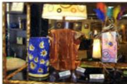
Students of teacher Sue Puchowitz, of Elkins Park, have their art on display at Moderne Life Interiors.

Teaming up with local independent art teacher Sue Puchowitz of Elkins Park, Young is displaying three-dimensional media from art students ranging from 5 through 15 years old through the end of the month. And though the pieces aren't for sale, as many of the students