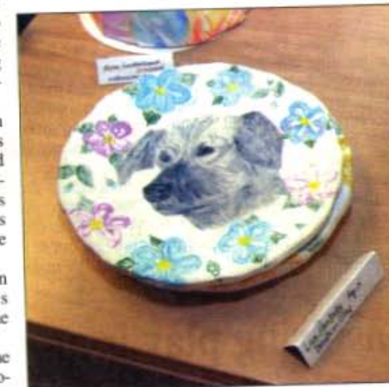
Artist Lisa Hanratty's clay plate is on display at Moderne Life Interiors in Jenkintown.

Moderne Life Interiors is located at 325 Old York Road, Jenkintown and can be reached at 215-886-8490; or www.modernelife.com .